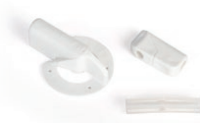
Fig. 2 External fixation devices