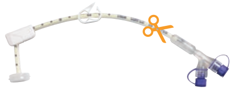
Fig. 3 CORFLO® PEG: Cut the tube to replace the feeding connector

Your healthcare professional will work as follows: