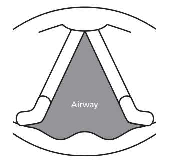
Resting vocal cords (when we breathe in and out without voice)