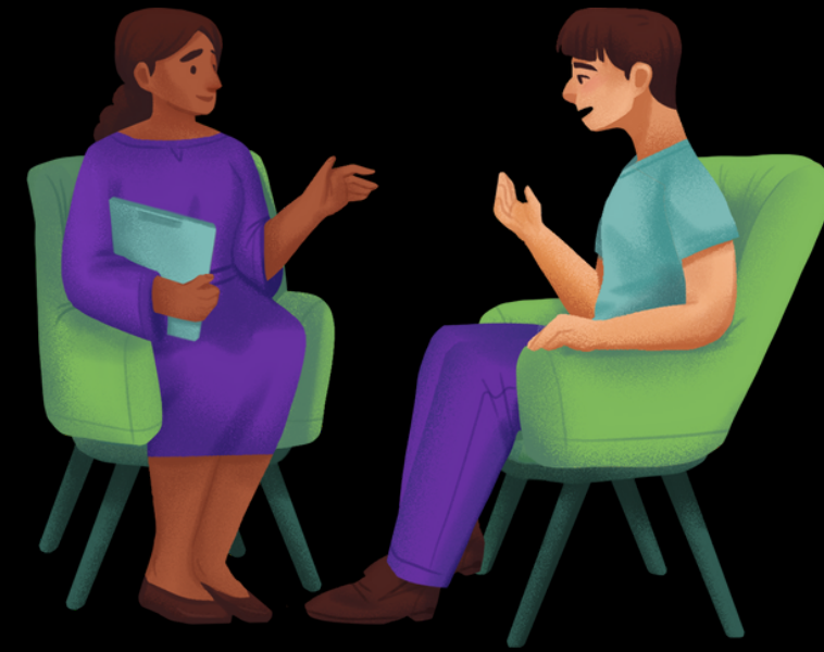
adjusting meetings to our needs and understanding health varies over time