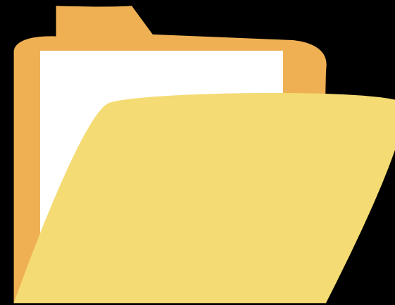
Rewards and Recognition payment forms