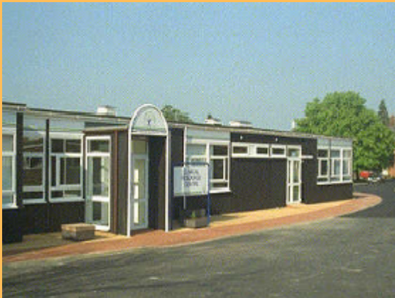
Twinwoods Clinical Resource Centre, Clapham, Bedford, MK41 6AT