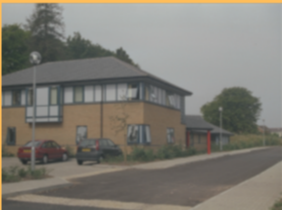
Beech Close Resource Centre, Beech Close, Dunstable, LU6 3SD